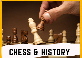
CHESS & HISTORY