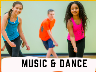
MUSIC & DANCE